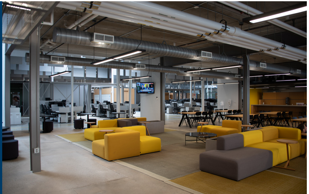
Multiple Touchdown Spaces