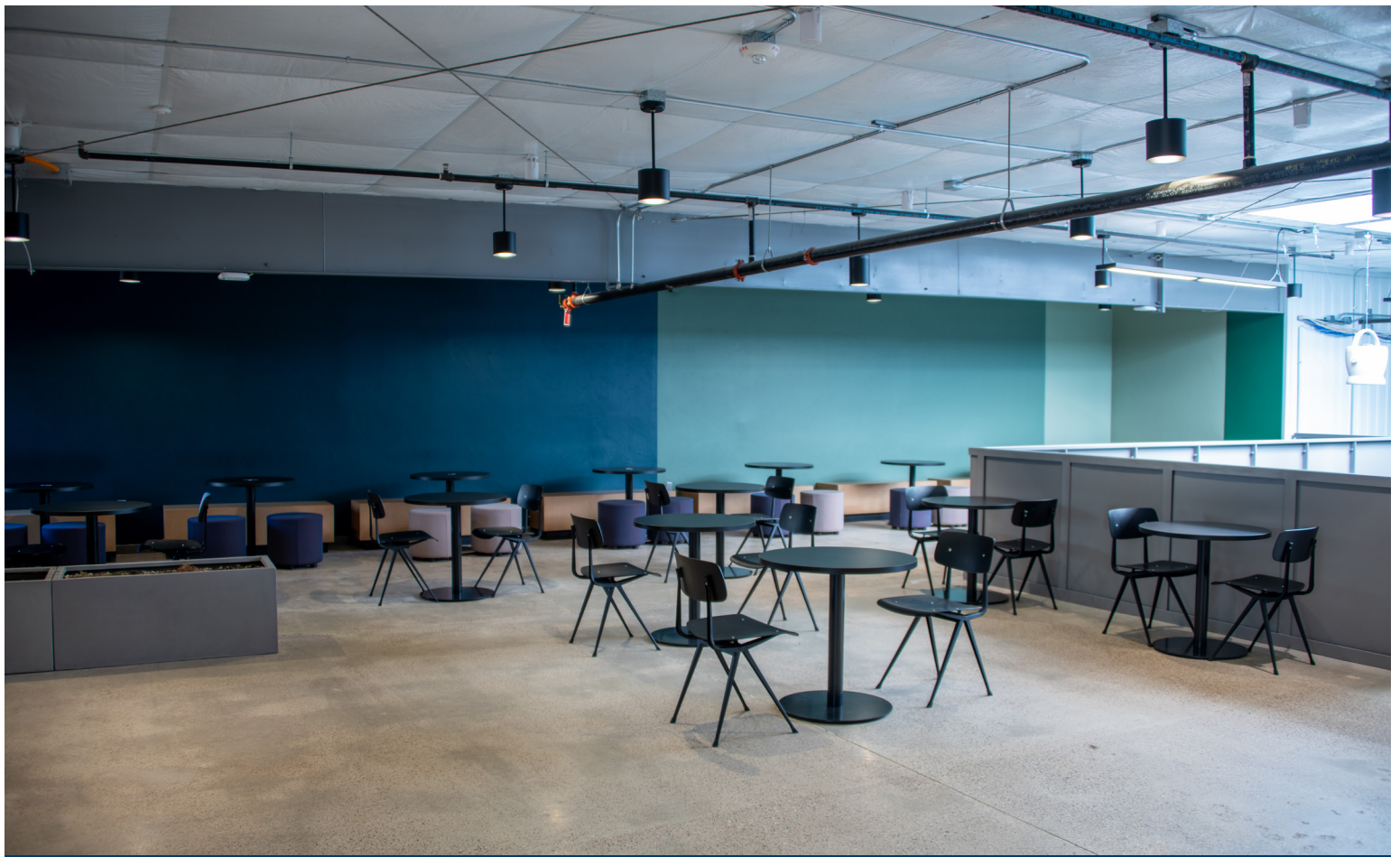
Open Collaborative Spaces