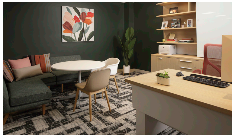
Private Office with Lounge Area