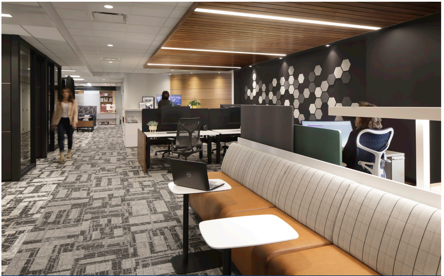
Touchdown Work Spaces