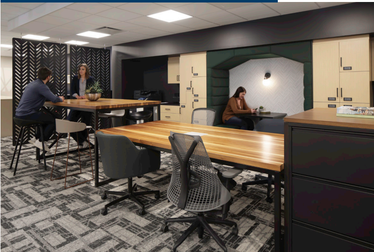
Multi-Use Touchdown Space