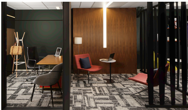
Semi-Private Lounge Area