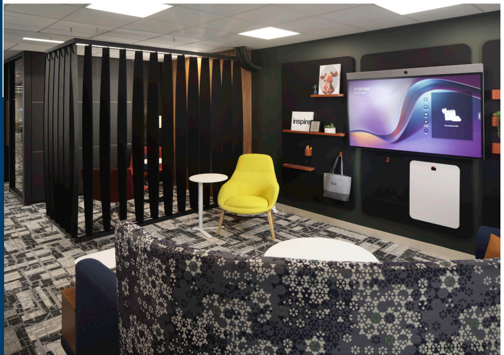
Open Collaborative Area