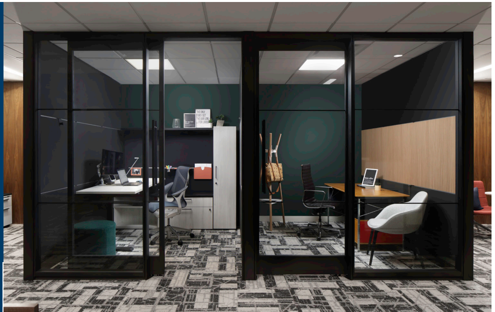
Modular Private Offices