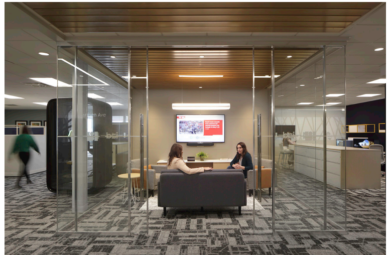
Lounge Meeting Space