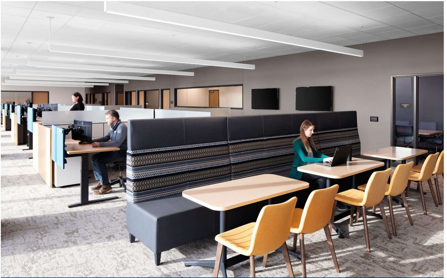
Workstations & Casual Seating

Celebrating 125 years, the City of Waukesha built a brand new City Hall!