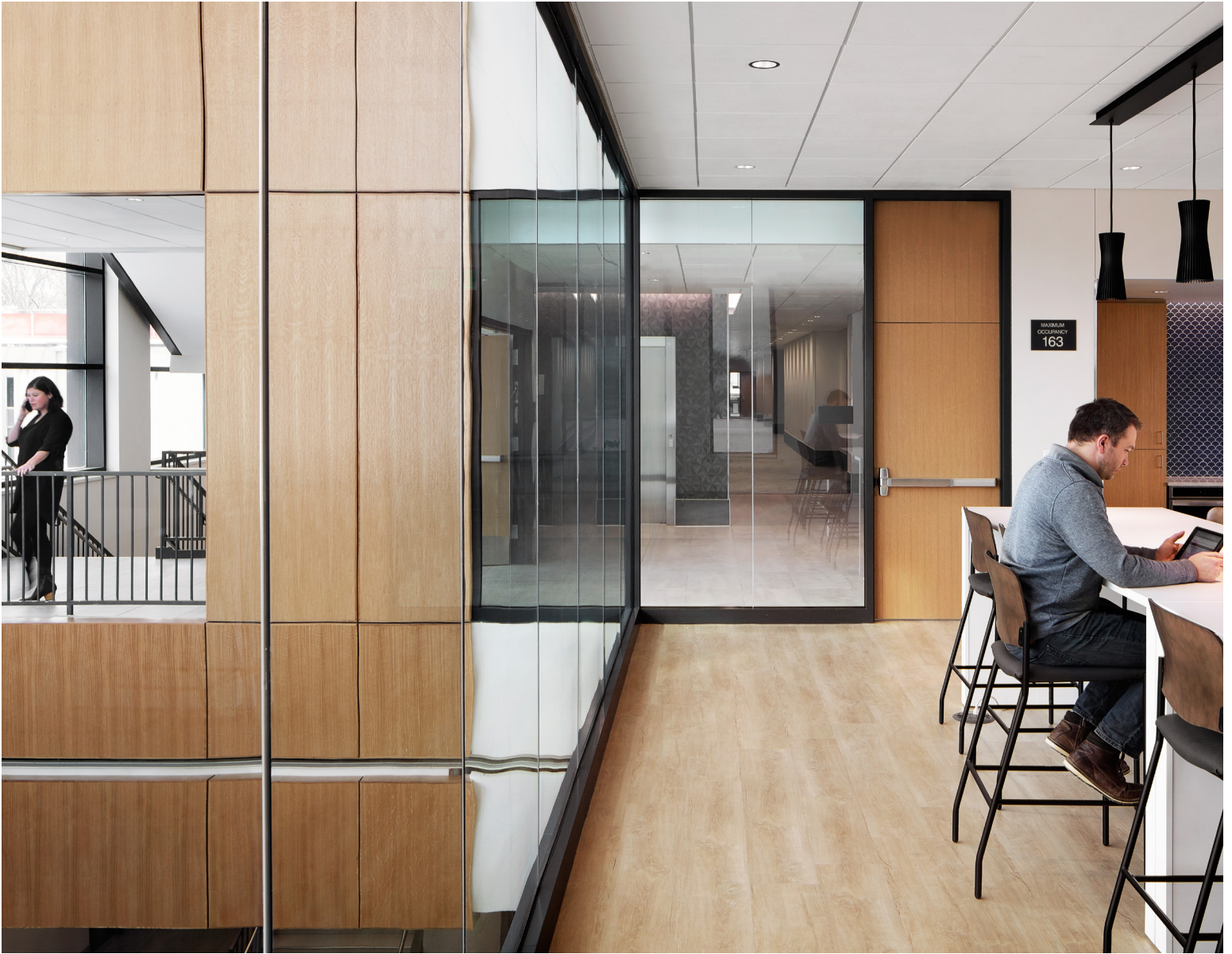
Collaborative Cafe Area/ View Into Atrium