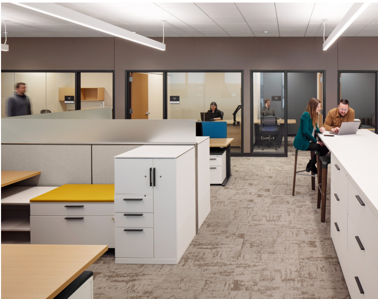
Work Storage & Collaboration Space

Celebrating 125 years, the City of Waukesha built a brand new City Hall!