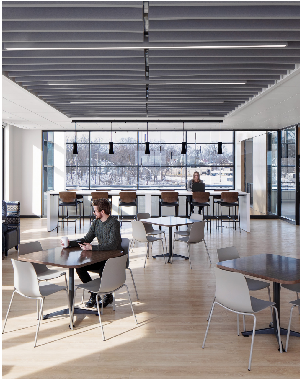
Collaborative Cafe Area