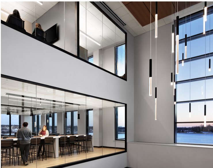
Atrium Lighting & Multi Level View