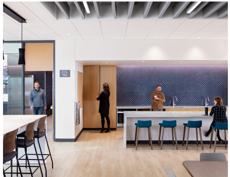
Collaborative Cafe Area