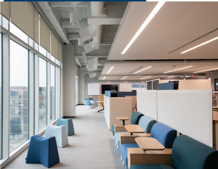
Open Touchdown Area