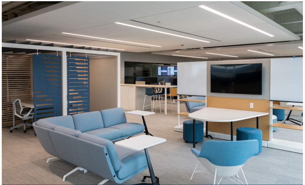
Open Collaboration Space