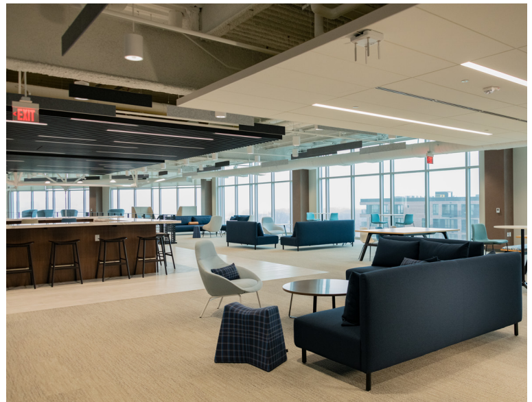
Open Touchdown Area