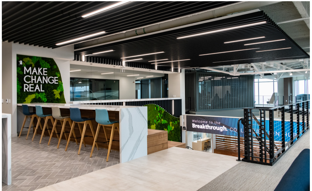
Feature Wall and SMART SPACES AV Integration Screen

Audio Visual Integration Wire Management Services