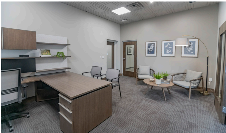
Executive Assistant Office