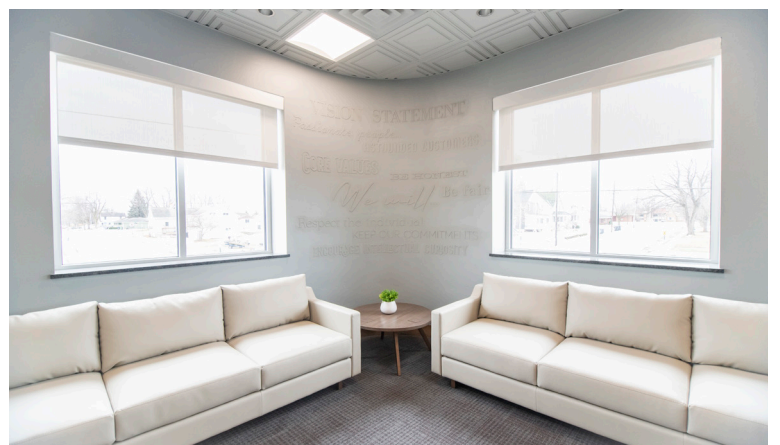
Touch Down Area